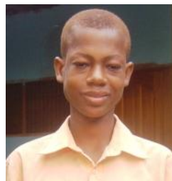
Richmond in JHS-2