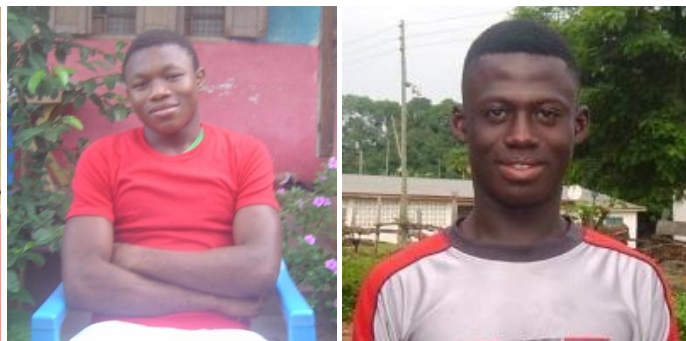
now how they are