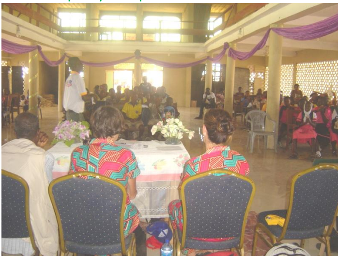
Sponsorship presentation ceremony

Some past years' pictures with Suzanne -----